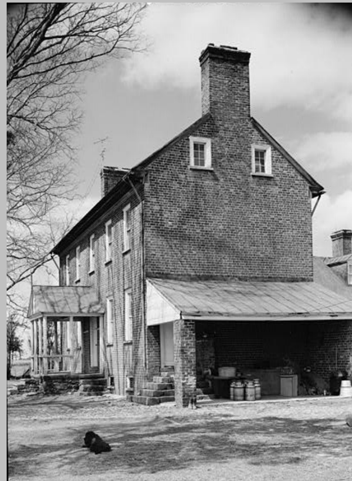
Main House, Green Hill plantation, Virginia, construction on rear wing begun in 1797; two-story front section erected later (photographs, 1960).

. . . Pannill's Big House, although built of brick, was only an I-house, the commonplace residence of a middle-class yeoman.