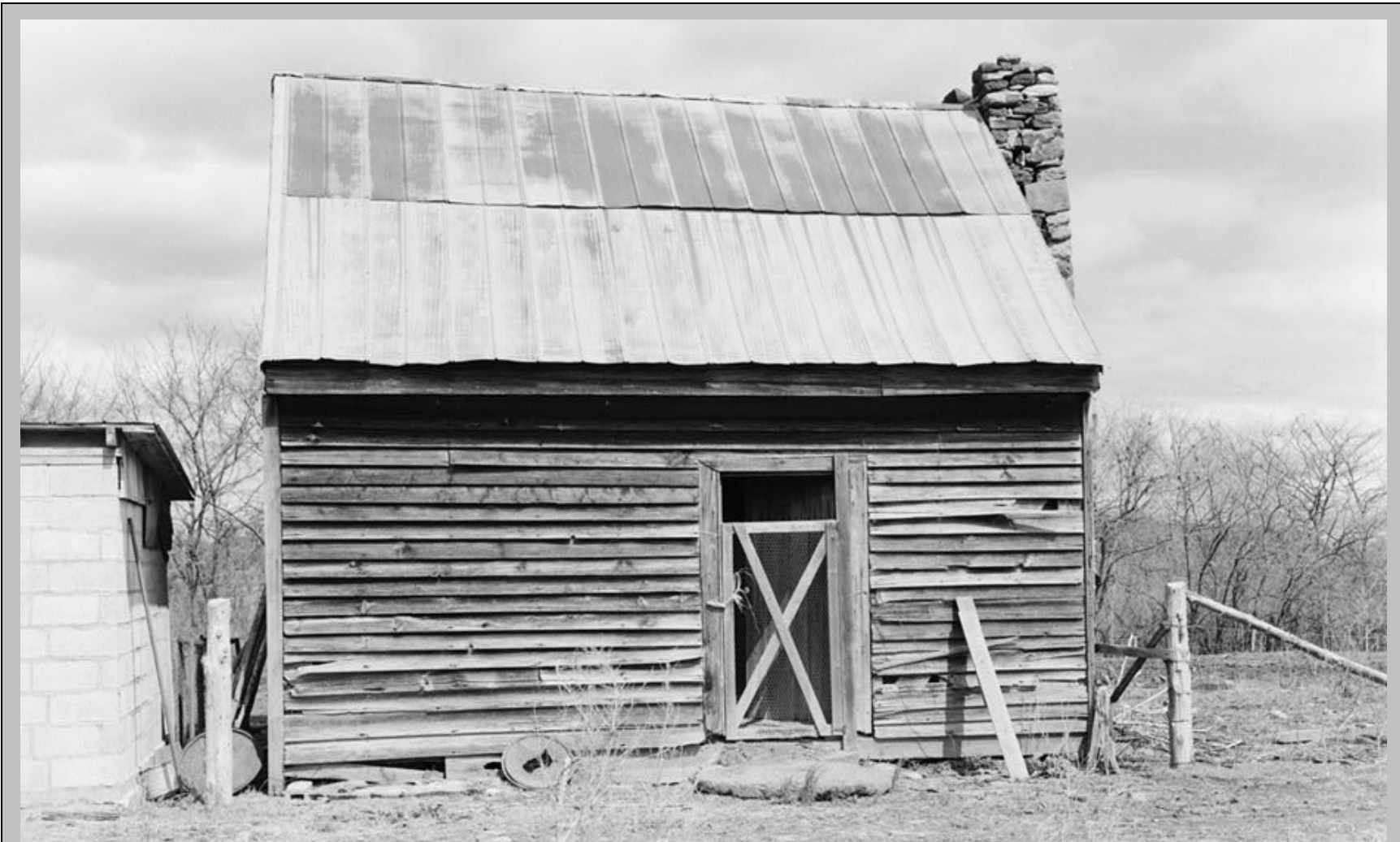
Slave quarter, Upper Town, Green Hill Plantation, Virginia, 1960. Most slave quarters (no longer extant) were located in Lower Town.

What the enslaved occupants of these buildings and spaces thought and felt remains hidden in the images, but their feelings and attitudes, fortunately, were preserved elsewhere.