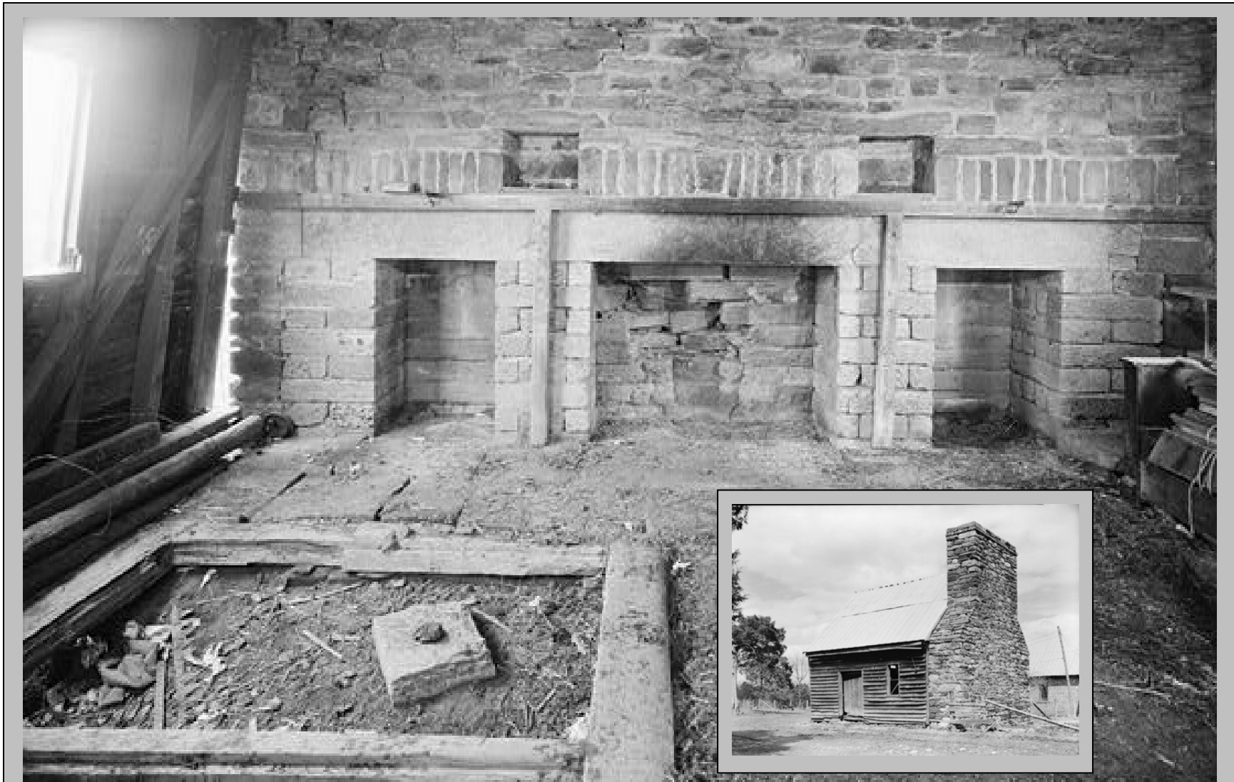
Kitchen, Green Hill Plantation, Virginia, 1960

Look at the pictures. Pore over the drawings. Check their details. Do it carefully, and you can develop almost a tangible sense of the buildings that once sheltered the everyday routines of slaves.