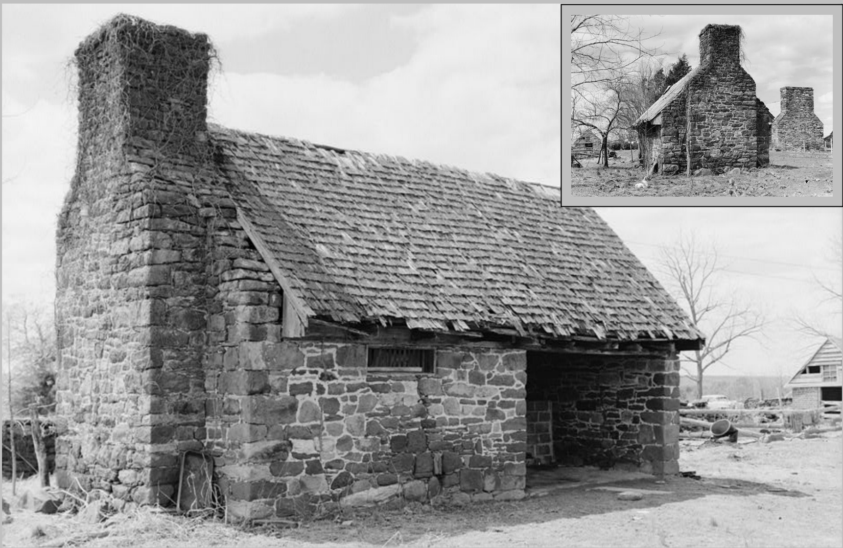
Laundry, Green Hill Plantation, Virginia, 1960

The slaves' agenda is the hidden dimension of a southern plantation. Looking over these places, one sees most clearly the pattern of well-known, European-derived fashions. The ordered surfaces of building facades and well-tended grounds, however, were underpinned by a slave community whose labor provided the wealth with which planters created their impressive estates. Vlach, Back of the Big House , 1993, p. 16.