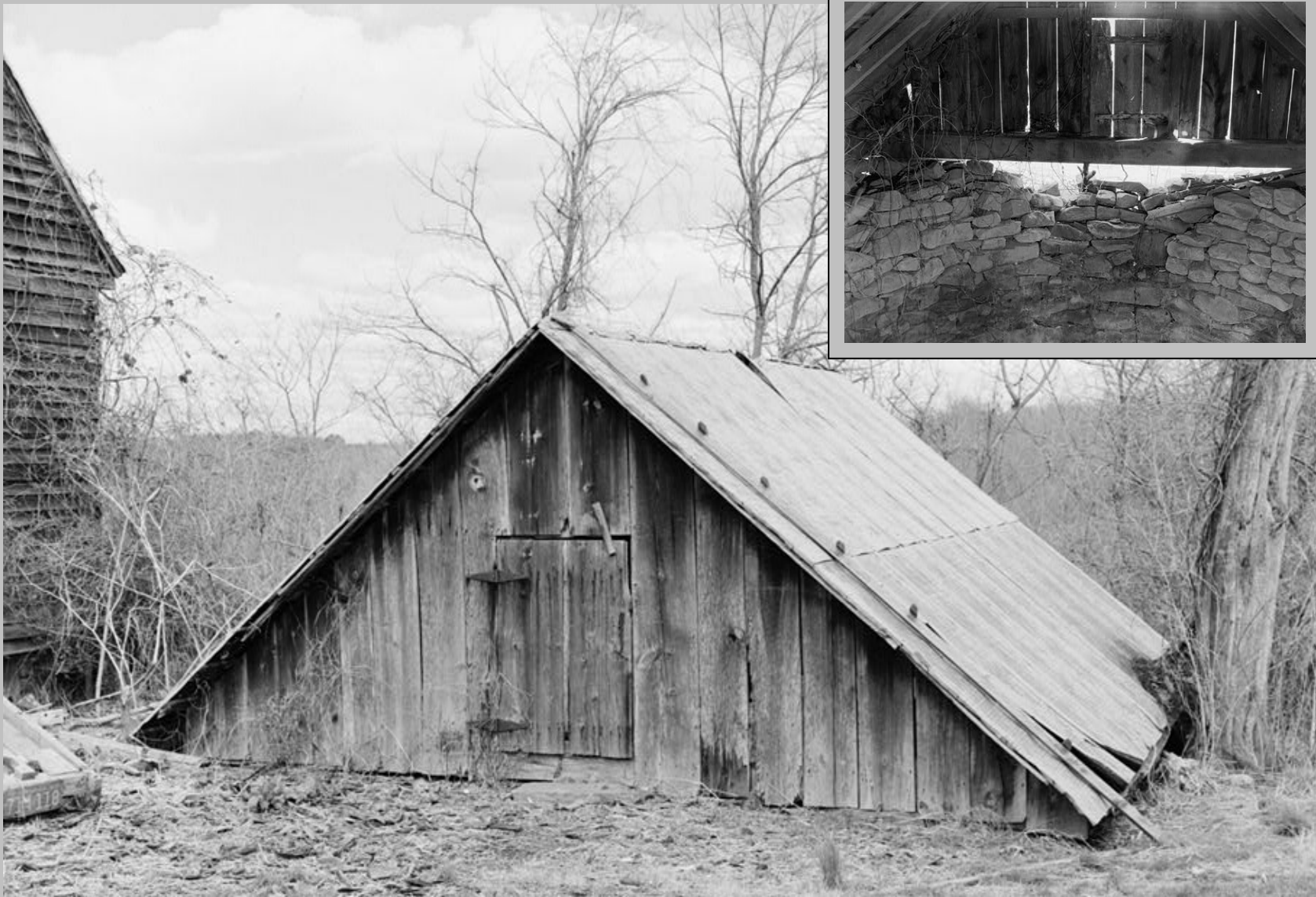
Ice House, Green Hill Plantation, Virginia, 1960