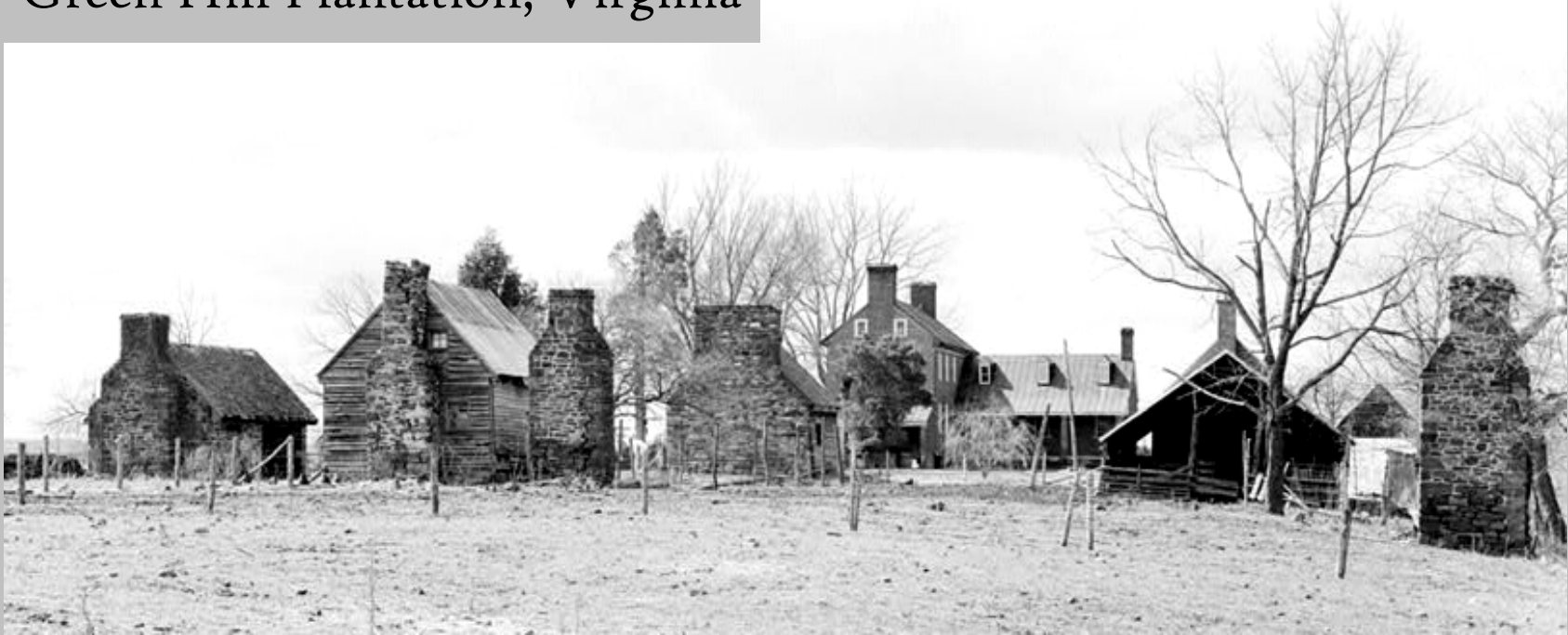
Upper Town, Green Hill Plantation, Campbell County, Virginia, 1960

Beyond the white master's residence, back of and beyond the Big House, was a world of work dominated by black people. The inhabitants of this world knew it intimately, and they gave to it, by thought and deed, their own definition of place.