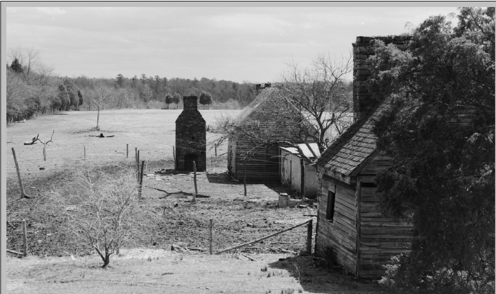
View from Upper Town toward Lower Town and the Staunton River, Green Hill Plantation, Virginia, 1960

Rhys Isaac has suggested that paths and trails into the countryside were the central elements of the slave landscape in Virginia. Some of these secret tracks led to clandestine meeting places in the woods, used sometimes for ritual purposes and at other times for festive parties at which fiddles were played and stolen pigs barbecued. . . A shortcut through the woods or marshlands that surrounded the fields may have allowed slaves from different plantations to rendezvous more conveniently and to return to their assigned tasks with less chances of detection.