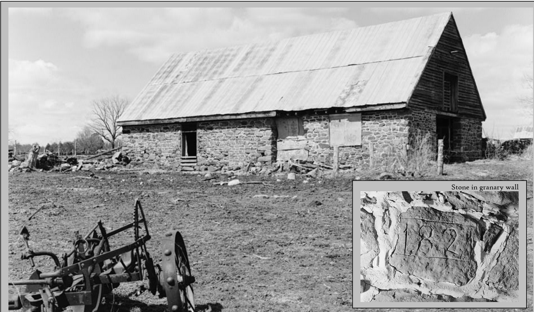
Granary, Green Hill Plantation, Virginia, 1960