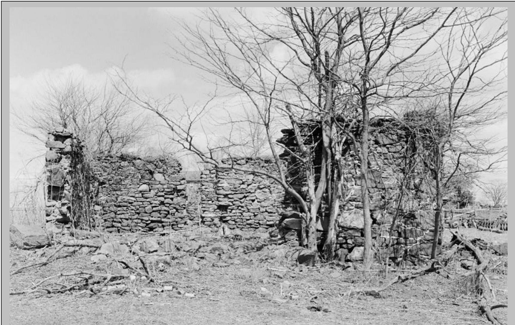
Stable (ruins), Green Hill Plantation, Virginia, 1960