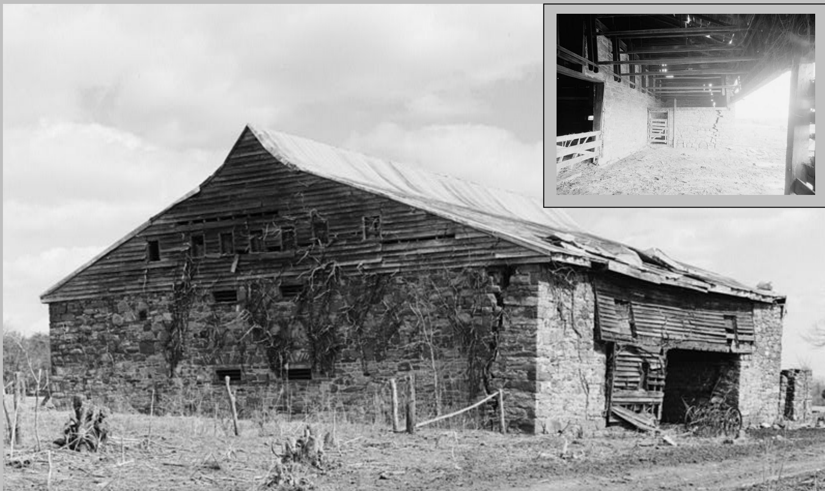
Tobacco barn, 75'x 60', including shed additions, Green Hill Plantation, Virginia, 1960

A feeling of autonomy was usually more pronounced on plantations worked by large groups of slaves, groups large enough to foster a sense of community. This feeling was so strong among the 174 slaves at Silver Bluff plantation in South Carolina that even at the conclusion of the Civil War they preferred to remain on the estate as a group rather than go their separate ways as individuals; in fact they refused to leave.