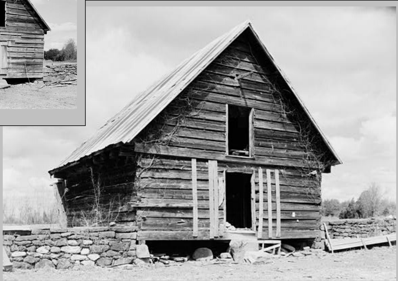
Log Barn, Green Hill Plantation, Virginia, 1960

By 1860 over 800,000 slaves were living mostly in the company of other slaves, in groups of fifty or more. On almost 11,000 plantations, consequently, slave settlements were big enough to resemble, in the words of former slaves occupants, "little towns." Vlach, Back of the Big House , 1993, p. 12.