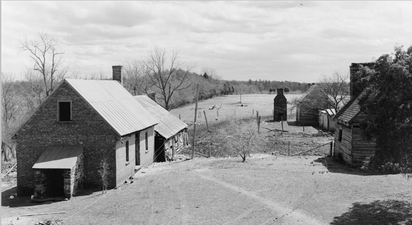
Green Hill plantation, Virginia, outbuildings as seen from the main house, 1960. "Upper Town" was positioned on a high bluff overlooking the Staunton River.

In addition to raising tobacco and wheat, Pannill also developed something of an industrial village. He not only milled grain but operated a fleet of keelboats that carried the flour downriver to markets in North Carolina. Among his slaves were carpenters, coopers, blacksmiths, shoemakers, weavers, and sawyers. Their workshops and dwellings were all located in Lower Town . . . The 1860 federal census indicates that Pannill owned eighty-one slaves, who were kept in seventeen houses. Most of these buildings [no longer extant] were probably in Lower Town.