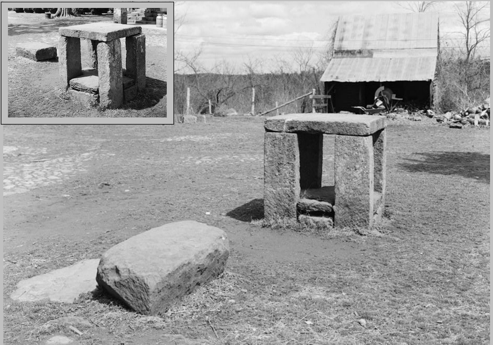
Slave auction area: auctioneer's stand and table for displaying slaves, Green Hill Plantation, Virginia, 1960